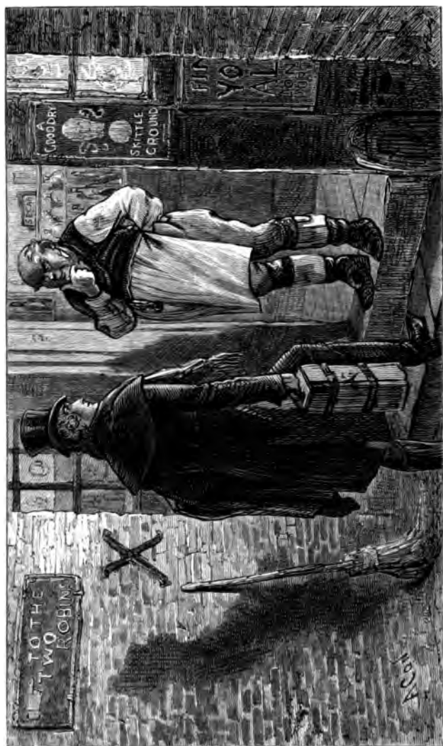
... Are you game for five shillings?—p 168